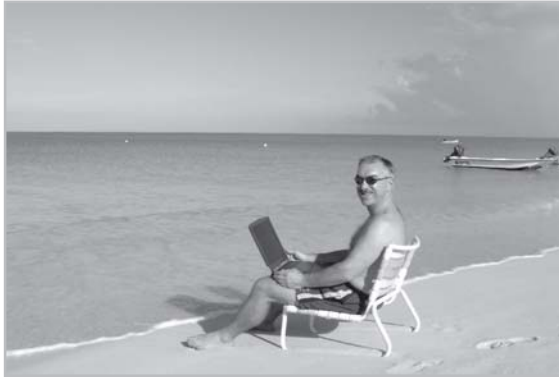
Working hard in a remote location. . .